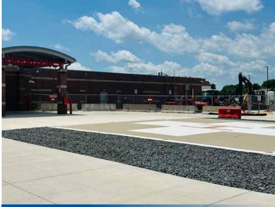
Construction began in the Spring on an addition to the west side of Story County Medical Center. The space will house a new permanent MRI designed to offer increased access to advanced care.

Learn more at storymedical.org/mentalhealth