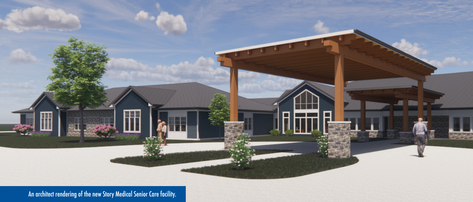
An architect rendering of the new Story Medical Senior Care facility.