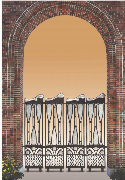
Shown above is a drawing of The River Gates, constructed in 2011 as part of Project AWARE through the Iowa DNR.